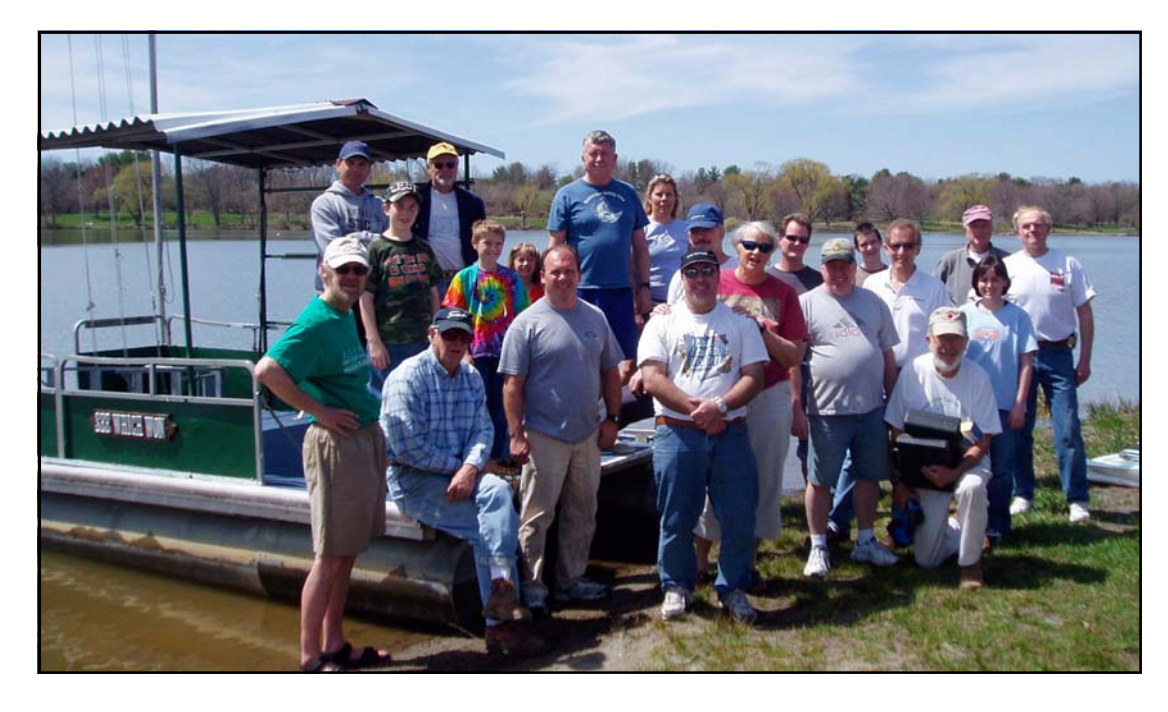
This intrepid group and a few not photographed spent Saturday, April 21<sup>st</sup> launching the "See Which Won" and the safety boats, building sunfish storage racks and organizing for the upcoming season. It is going to be a GREAT Summer!